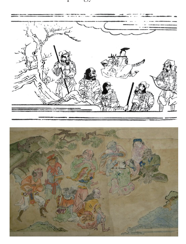
Figure 2 (Top). Illustration from Onzōshi shimawatari (Shibukawa edition), in the collection of the Ukai bunko 鵜飼文庫 archive of the National Institute of Japanese Literature.