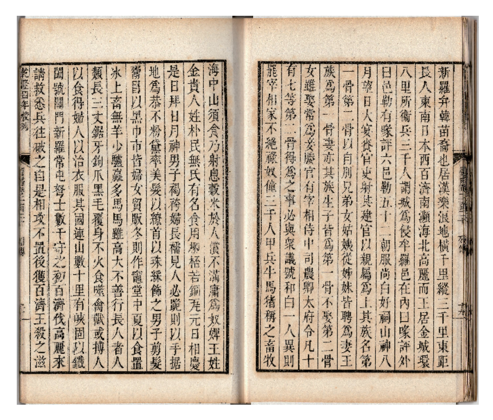
Figure 1. In volume 220 of the Xin Tangshu 新唐書 (Bainaben 百衲本 edition), the entry about "Big People" (chōjin 長人).

surviving on the Silla side, it becomes clear that in the area of Silla's northeastern border frontier there lived groups of the Mohe 靺鞨 people, inhabitants of the Balhae kingdom 渤海, and that Silla, in the latter half of the 7<sup>th</sup> century, had placed on that border some kind of military installation. This was even termed a "barrier gate," or at times an "iron barrier fort" (Ch. tieguancheng 鉄関城). Histories also record that the early half of the 8<sup>th</sup> century saw an increase in military tensions with Balhae, and that Silla accordingly strengthened and repaired those of its military facilities oriented towards this region. In other words, when the Big People legend reached Tang China around the mid-8<sup>th</sup> century, on Silla's northeastern border frontier, there did in fact exist a military installation named after an iron gate, and military tensions between Silla and Balhae were indeed on the rise.