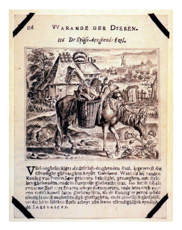
Figure 4. Donkey carrying nourishment (Spijsedraghende Ezel). Hand-copied illustration by Yata Shijoken 矢田四如軒, text copied by Yamaguchi Tamenori 山口為範, after Joost van den Vondel, Vorstelijcke warande der dieren . (Maeda Tosanokami-ke Shiryōkan).

Shinmura Izuru 新村出 (1876–1967) wrote about it in 1929.<sup>31</sup> At the time, Shinmura identified the pages as "pages from a Dutch Aesop" (ranhun Isoho monogatari dankan 蘭文伊曾保物語斯簡), but it is not certain that the Kaga samurai recognized the animal fable emblems as explicitly Aesopian. It is a curious set, apparently an attempt to create hand-produced facsimiles of pages from a printed European book, in which, somewhat uncharacteristically for Japan, both sides of the paper were used (more commonly one would use only one side of a sheet that was then folded in two).