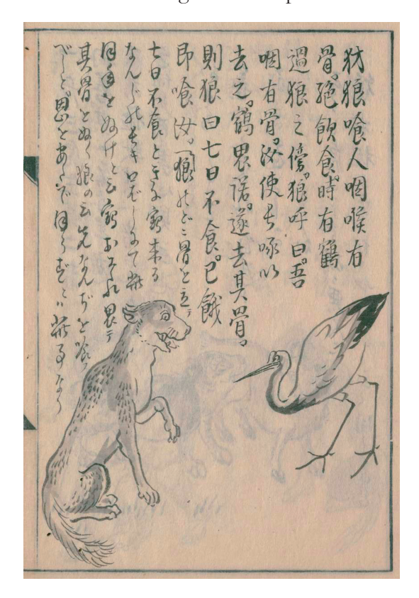
Figure 5. The wolf and the crane. Illustration by Shiba Kōkan 司馬江漢, in his Kunmō gakaishū 訓蒙画解集 (no. 106), MS dated Bunka 11/1814. (National Diet Library). https://doi.org/10.11501/2532348

place in the universe, and that they are held back by their reluctance to engage with European learning. Then he comes to the point: