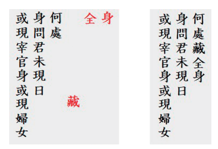
Figure 3a. (Left) Transcription of inscription visible on screen in background, Figure 2. Here the characters are arranged as they appear on the painting-within-a-painting, the final three being deliberately scattered. (Prepared by author).