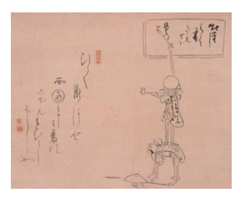
Figure 5. Junrei rakugaki zu 巡礼落書図 ("Pilgrim's Graffiti"). Painting by Hakuin. Right: Two pilgrims cooperate to leave graffiti on a temple frame. Left: An inscription whose beginning hibiku taki-tsu-se ひゝ〈瀧つせ associates the scene with Seiganto-ji Temple 青岸渡寺 at Mt. Nachi 那智, first stop on a famous pilgrimage route threading thirty-three shrines devoted to Kannon. (Private collection).

painting of Kannon having used the same visual composition as the "Ten Kings" paintings? What it expresses, even in the Kannon painting here, is that both Kannon and Emma are emanations equally of the universal One Mind.