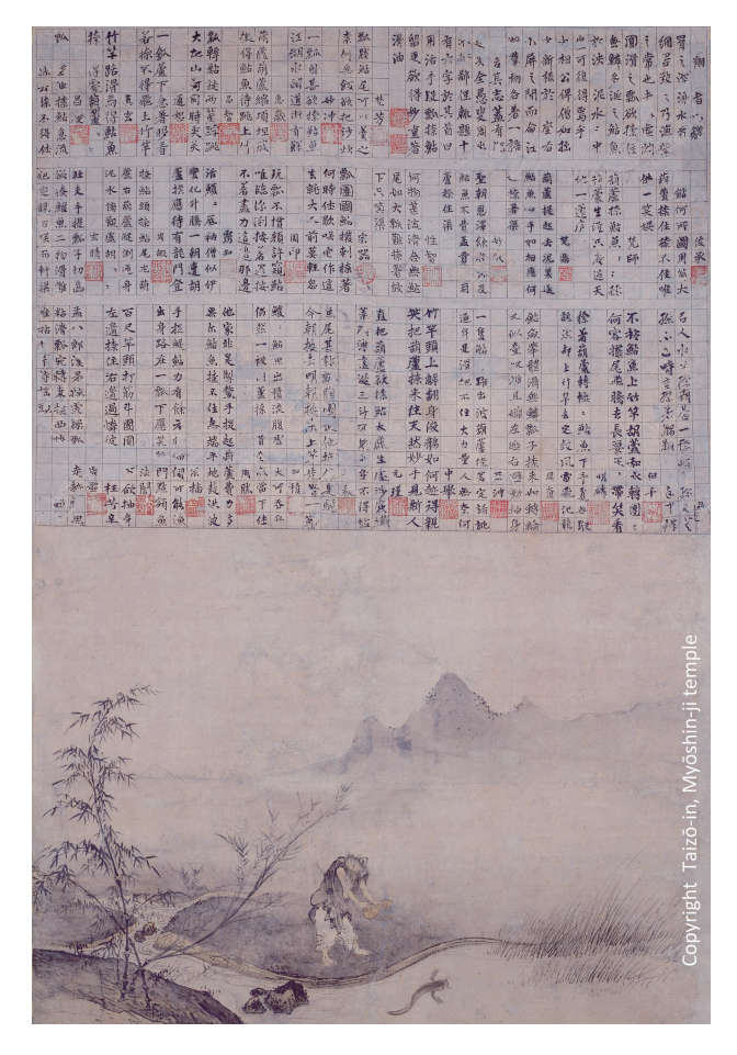
Figure 1. Hyōnen-zu 瓢鮎図 ("Gourd and Catfish"). Painting by the monk Josetsu 如雪. Completed by 1415. Lower half: In a visualized kōan 公案, a man attempts to catch a catfish by means of a hollowed-out gourd. Upper half: Chinese poems treating the pictured kōan by thirty-one monks. (Myōshin-ji Temple, Taizō-in).

using a "water-and-sky in single color" (suiten isshoku 水天一色) palette such that no clear line divides the water from the sky above. The third poem in the series, by Unrin Myōchū 雲林妙冲 (dates unknown) runs as follows: