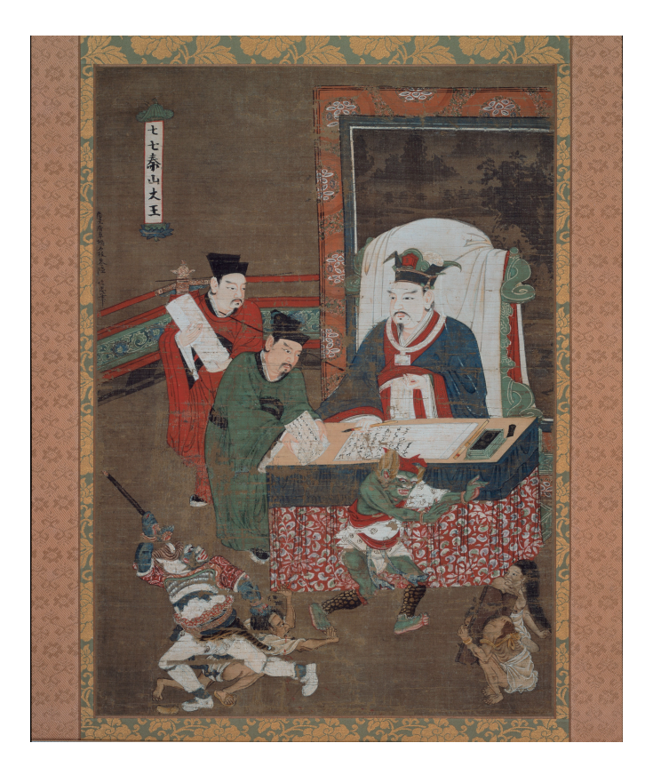
Figure 4. Jūōzu 十王図 ("Ten Kings"). From a painting series depicting the Ten Judges of the Underworld. Here pictured is Emma 閻魔, seated before a writing desk, with a painted screen behind him—a visual composition mirrored by Hakuin's painting in Figure 2. (Eigen-ii Temple)

"greater things." For it is none other than Kannon himself that appears in the background sansui , he whose ultimate form is beyond all shape.