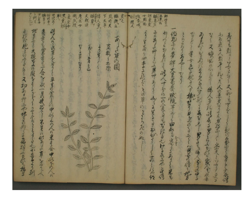
Figure 6. The ashitagusa plant (angelica) in Bakin's autograph copy of Hachijō hikki , with marginal notes (top). (Waseda University Library). <u>https://www.wul.waseda.ac.jp/kotenseki/html/i04/i04_00600_0148</u> (image no. 9)

only in Hachijōjima," this being another name for the "Isle of Women" mentioned in the Bencao gangmu .<sup>47</sup>