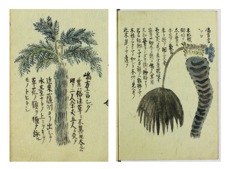
Figure 3. The soro (right) and shida (left) trees in Izu kaitō fudoki 伊豆海嶋風土記, vol. 2 (right) & vol. 3 (left). (Fuji City Library). https://library.fujishi.jp/c1/bib/fuji_11698850.pdf (image no. 20), [..._11698851.pdf] (image no. 31)