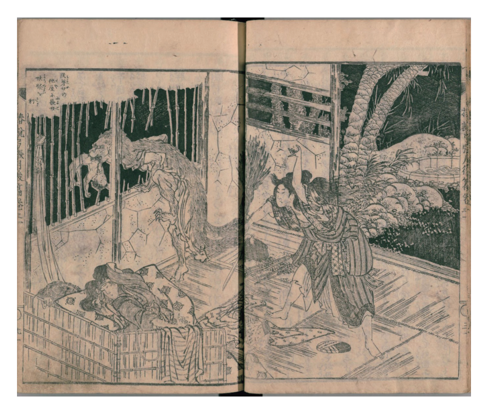
Figure 5. Scene from Chinsetsu yumiharizuki (II.17). Entitled: "Nyoko kills a monster in her cousin's hut." Note the palm trees in the background. (National Diet Library). https://doi.org/10.11501/2557124 (image no. 32)

the narrative and even in giving new meaning to Tametomo's actions. Here again, confronting the Yumiharizuki text with its sources will shed light on the matter.